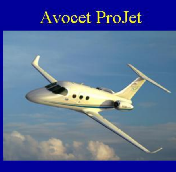
Very Light Jets over Florida