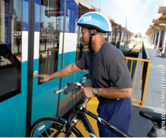
NORTH COUNTY TRANSIT DISTRICT