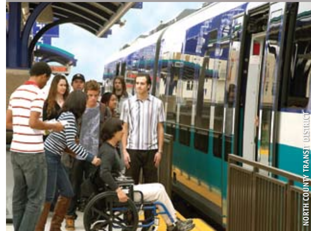
NORTH COUNTY TRANSIT DISTRICT